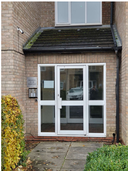
Entrances (Main Doors)