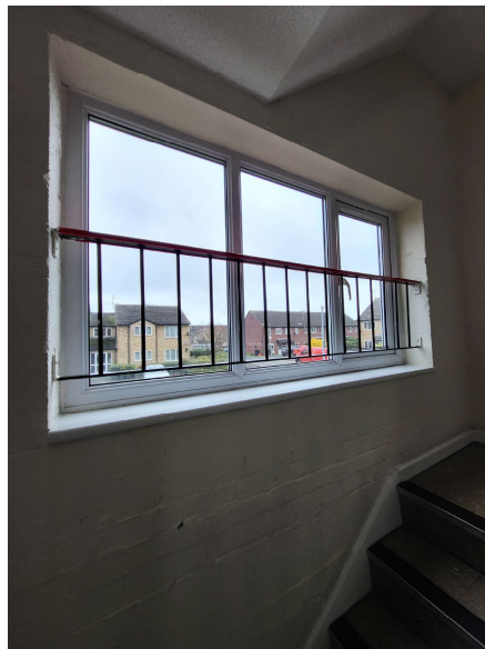
Windows (Communal Windows)