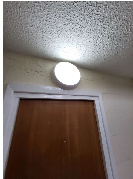
Lighting (Standard and Emergency Lights)