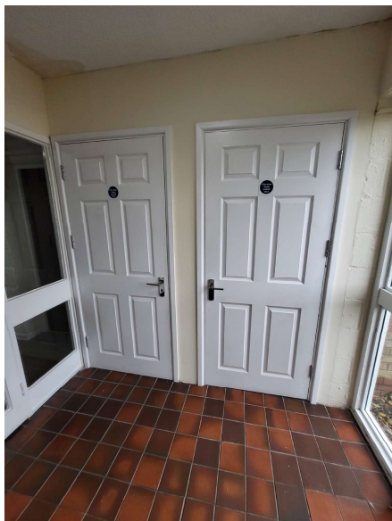
Cupboard Doors (Electrical Cupboard Doors)