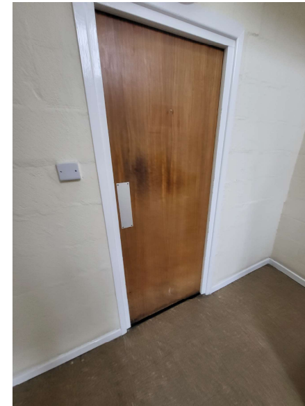
Internal Doors (Compartment Doors)